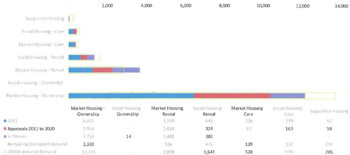
Figure 4: Occupied multi-family dwelling units (2011), Net new multi-family dwelling units approved (2011 – 2020), and In-stream applications compared to the estimated demand (2030).

Reviewing Figure 2 data on household income against the assessment of housing demand in Figure 4, the Task Force strongly believes that the housing demand model and the consequent focus on new development needs to be reconsidered. As shown in Figure 4 above, progress has been made in adding units across several housing categories, but there is an observable lack of growth in the areas of rental and non-market housing. Given the District’s income demographics (including the noticeable loss of households in the low- to moderate-income brackets), we see the need for more housing choices, particularly in subsidized rental, co-op and co-housing.