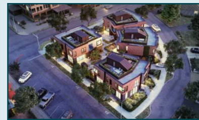
*Provided by applicant for illustrative purposes only. The actual development, if approved, may differ.