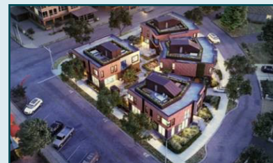
*Provided by applicant for illustrative purposes only. The actual development, if approved, may differ.