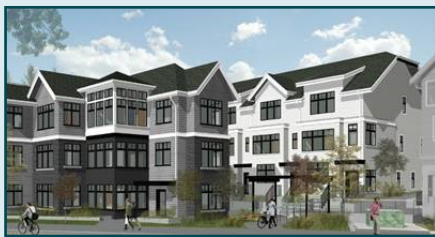
*Provided by applicant for illustrative purposes only. The actual development, if approved, may differ.