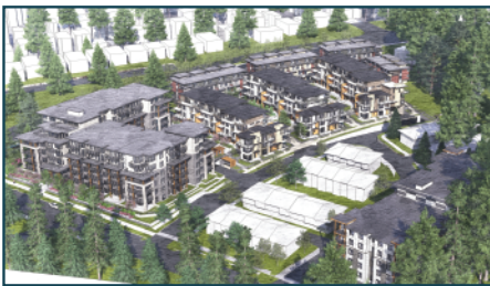
*Provided by applicant for illustrative purposes only. The actual development, if approved, may differ.

Please note that Council may not receive further submissions from the public concerning this application after the conclusion of the public hearing.