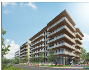
*Provided by applicant for illustrative purposes only. The actual development, if approved, may differ.