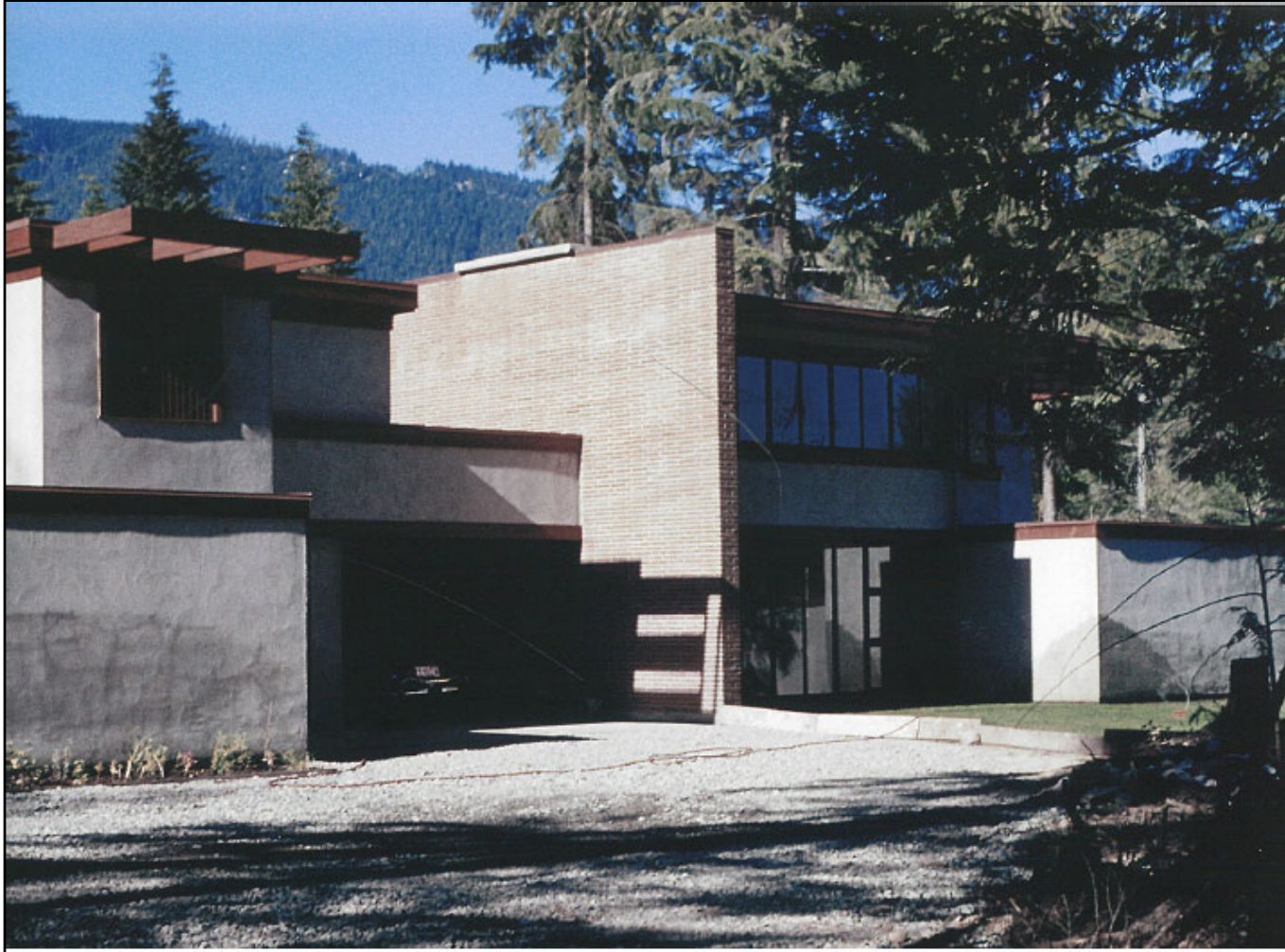
Photo of existing heritage building