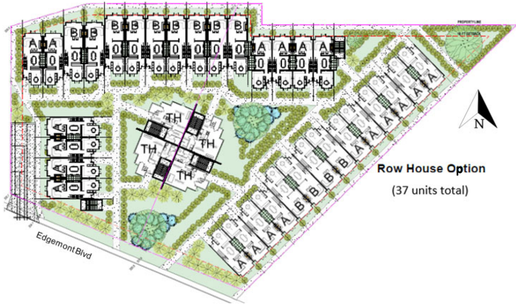
Row House Option (37 units total)