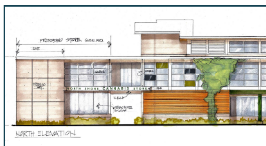
Proposed store front

been exhausted, there will be an opportunity for additional speakers to make submissions by telephone. Dial-in information will be provided at the meeting over the internet to those viewing the video stream.