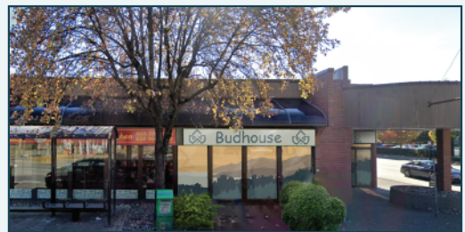
Proposed store front