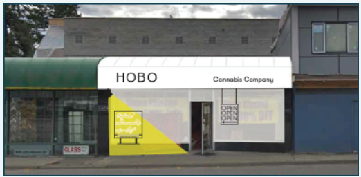
Proposed store front