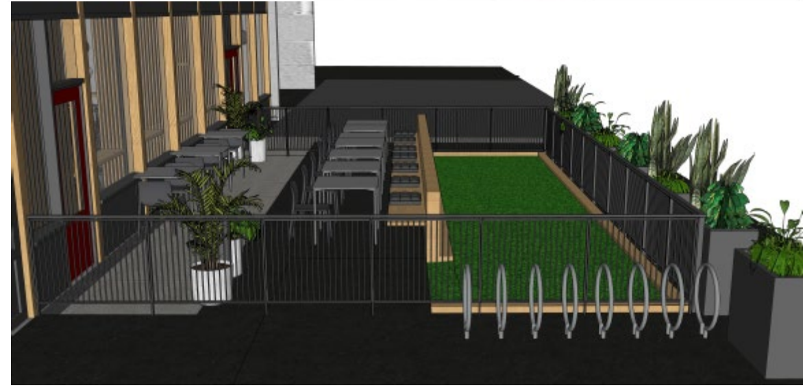
Renderings of proposed patio

(Seating layout will be revised to reflect Covid-19 spacing requirements)