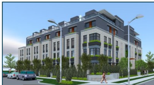
*Provided by applicant for illustrative purposes only. The actual development, if approved, may differ.

Development Zone 122 (CD122) and rezone the subject site from Single-Family Residential 6000 Zone (RS4) to CD122. The CD122 Zone addresses use and accessory use, density, amenities, setbacks, site and building coverage, building height, landscaping and parking.