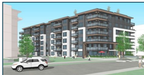
*Provided by applicant for illustrative purposes only. The actual development, if approved, may differ.

Bylaw 8314 proposes to amend the District's Zoning Bylaw by creating a new Comprehensive Development Zone 116 (CD116) and rezone the subject site from Single-Family Residential 6000 Zone (RS4) to CD116 and a portion of site (5m on west side) rezoned to Neighbourhood Park (NP). The CD116 Zone addresses use and accessory use, density, amenities, setbacks, site and building coverage, building height, landscaping and stormwater management and parking.