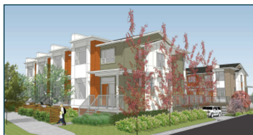
*Provided by applicant for illustrative purposes only. The actual development, if approved, may differ.