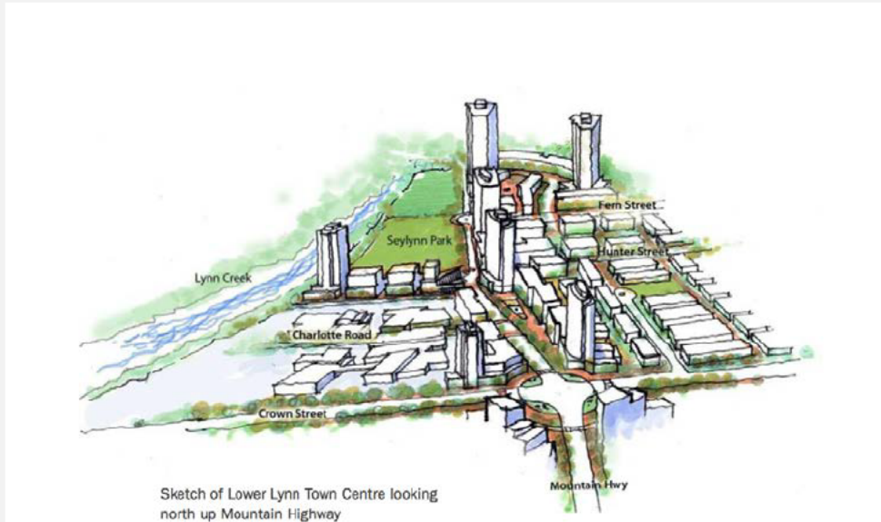
Sketch of Lower Lynn Town Centre looking north up Mountain Highway