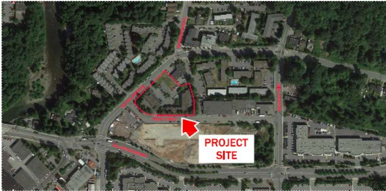
AERIAL OVERVIEW SCALE 1:2000