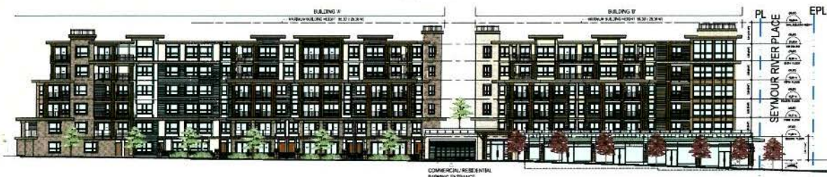
2 FRONT STREET ELEVATION A4.1 SCALE 1/8" = 1'-0"