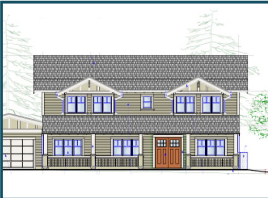
This rendering provided by applicant for illustrative purposes only. The actual development, if approved, may differ.