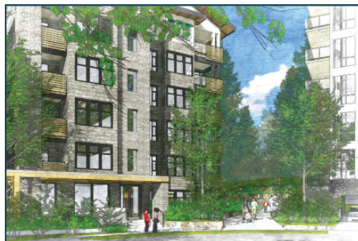
*Provided by applicant for illustrative purposes only. The actual development, if approved, may differ.

Bylaw 8304 proposes to amend the District's Zoning Bylaw by creating a new Comprehensive Development Zone 115 (CD115) and rezone the subject site from Multi-Family Residential Zone 2 (RM2) to CD115. The CD115 Zone addresses use and accessory uses, density, setbacks, building height, building and site coverage, landscaping and storm water management and parking.