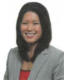
Bowinn Ma MLA North Vancouver-Lonsdale

I am requesting that the District of North Vancouver Mayor and Council join the Integrated North Shore Transportation Planning Project as a Core Partner Agency. Participation from municipalities includes: