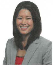
Bowinn Ma MLA North Vancouver-Lonsdale

Mayor and Council District of North Vancouver 355 W. Queens Rd North Vancouver, BC V7N 4N5