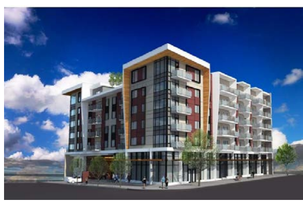
*Provided by applicant for illustrative purposes only. The actual development, if approved, may differ.