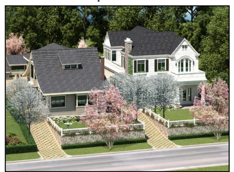
*Provided by applicant for illustrative purposes only. The actual development, if approved, may differ.