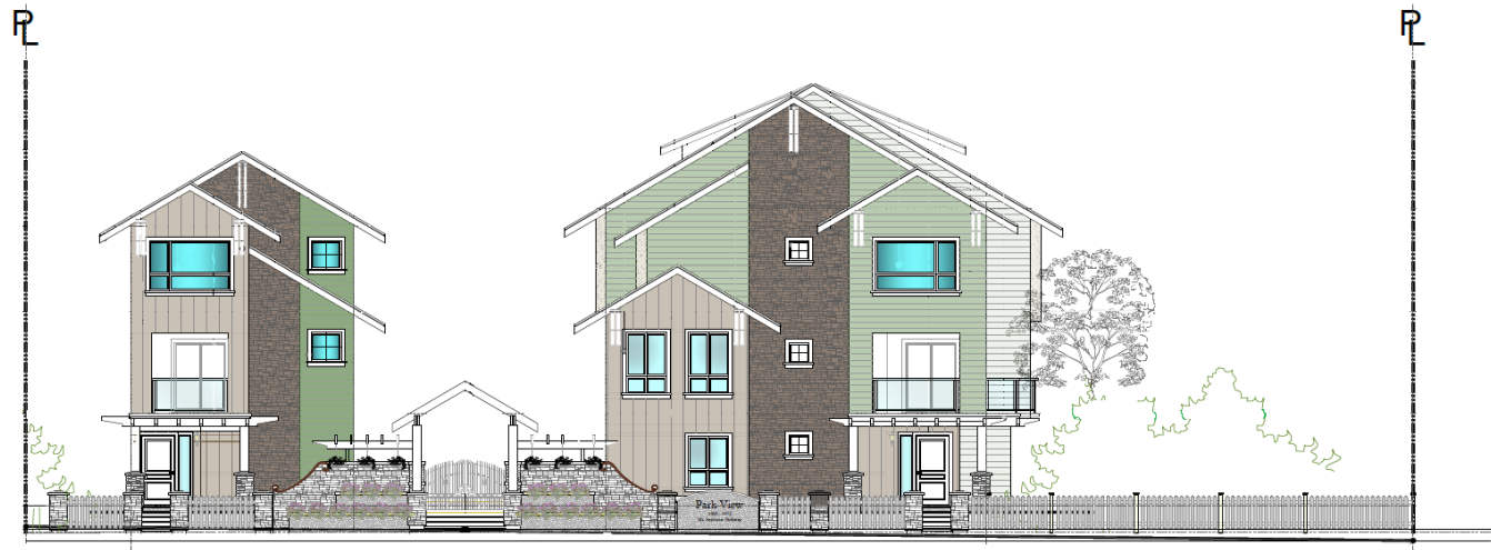
STREET ELEVATION - ALONG MT. SEYMOUR PKWY