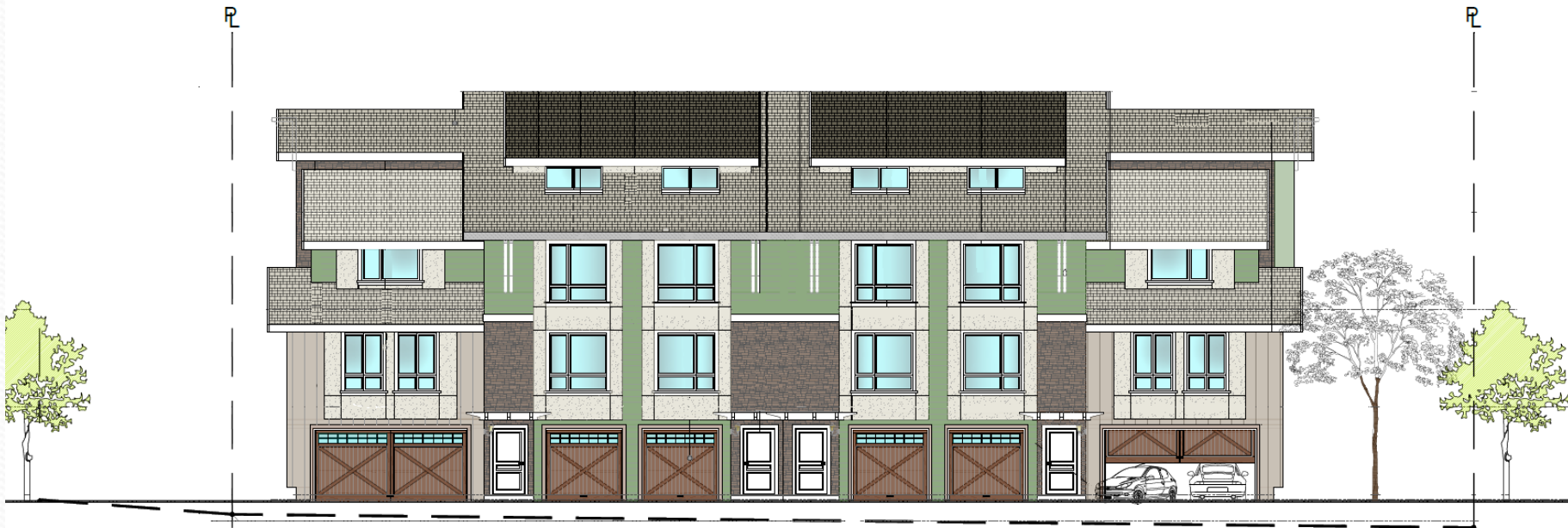
BUILDING A - WEST SIDE ELEVATION